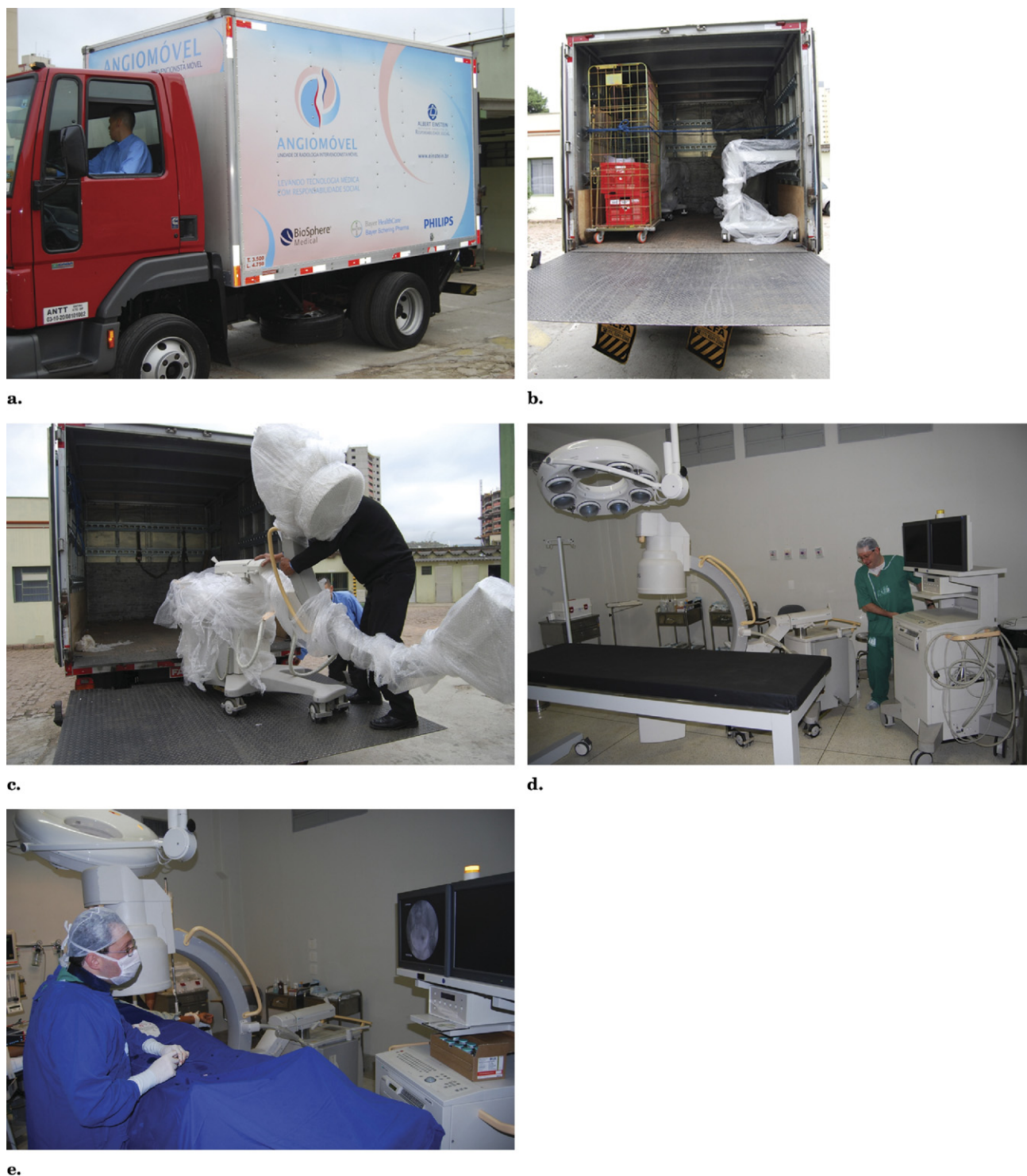
Figure 1. Logistics of mobile UAE unit. (a) The ANGIOMÓVEL truck arrives at a public hospital in the São Paulo metropolitan area. (b) The truck carries a portable c-arm, a radiologic table, protection aprons, and a trolley containing supplies. Equipment and supplies are unloaded into the hospital (c) and placed in the operation theater (d), where a procedure suite is temporarily prepared for embolization. (e) The procedure is performed with the c-arm in the in the operation theater. (Available in color online at www.jvir.org .)

changes in uterine and tumor volume before and after UAE and a Fisher test was performed to assess changes in QOL from baseline to 12 weeks and 1 year after UAE. P values of less than .01 were considered statistically significant.